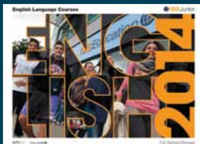
ISIS Junior Off Season Courses