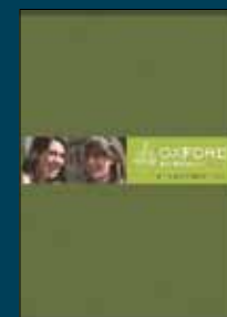
Oxford Tutorial College A-Level Programmes