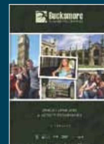
Bucksmore Summer Programmes