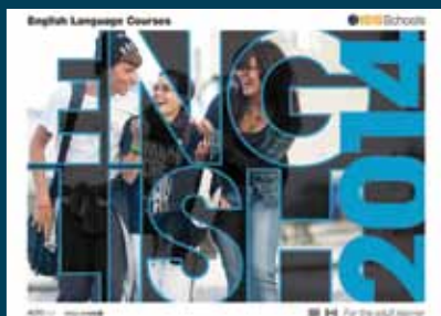
ISIS Adult Courses