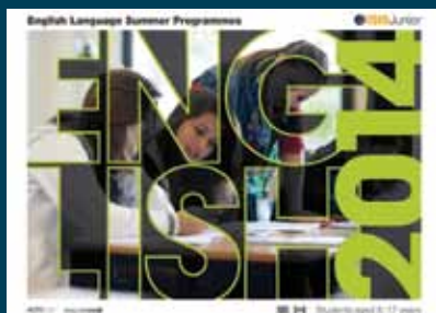
ISIS Junior Courses